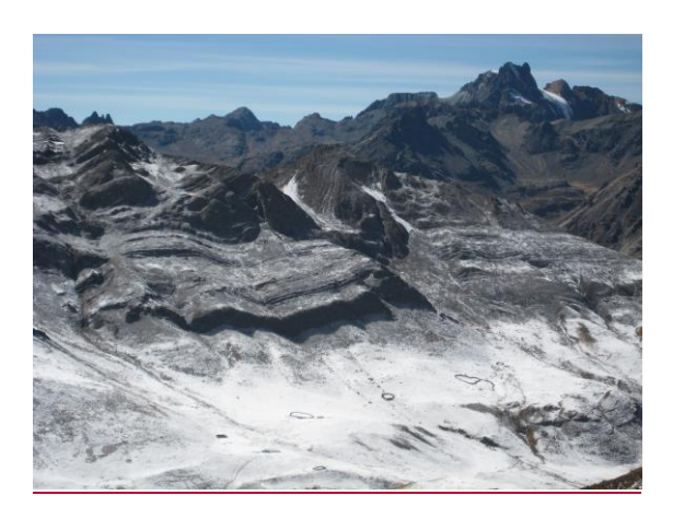
FIGURE 1.3 HERE puna and cordillera over Rapaz in wet season, with a herders' corral and house in distance.

Yet Rapacinos don't experience the heights as inhospitable. When I asked which they like better, their herding life up on the high pastures ( puna , janka ) or their life as village-based farmers, almost everyone said "I'd rather be on the puna, that's a beautiful life." Tawny grass waving in the wind, brawny bulls and graceful alpacas, meals of sizzling meat, brilliant sunlight and starlit nights, cozy sleep in thatched stone igloos – these are images of well-being, and not at all the freezing privation that lowlanders imagine (see figs. I.2, I.3). Using solar electric panels, people on the remote slopes even enjoy media appliances. Animals bred on rough puna grasses are loved and bragged about. From adolescence, people prove their valor by fighting anything that hurts the herds: condors, foxes, and pumas, and also rustlers. They devote offerings and invocations to their mighty neighbors, the living mountains who "own" rain and thereby give or withhold this kind of well-being.