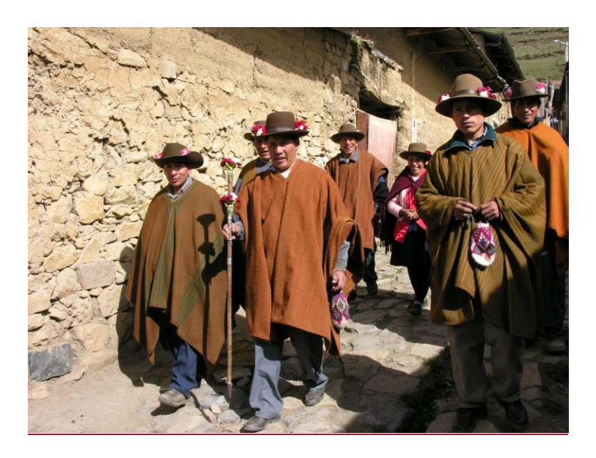
FIGURE 1.9 HERE Procession of balternos, members of an inner traditional government today called the Agropastoral Committee

The remaining members of the inner cabinet are the six balternos ('subalternos'), elected yearly.<sup>23</sup> The balternos perform the public parts of their jobs at assemblies of the community and do their paperwork at the state-recognized community offices.<sup>24</sup> They also gather by night in Kaha Wayi for more private ritual-cum-administrative meetings. This fire-lit, coca-taking meeting is called rimanakuy 'the conversation.' In it a ritualist leads devotions to the mountains in the form of long invocation chants accompanied by drinks and massive amounts of coca leaf both as stimulant and as offering (See Ch.2).