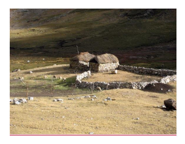
FIGURE 1.4 HERE A herder's house on an estancia.

Rapaz's temple has the mission of propitiating but also making demands of mountains. People and terrain are related through a system of rights and duties more like a constitution than a theology. It is explained in Chapter 2.