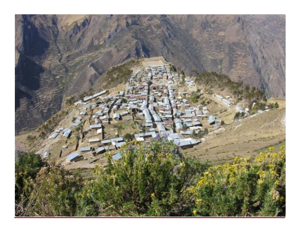
FIGURE 1.1 HERE Rapaz village seen from Cerro Calvario.

This chapter concerns how one population made of the soaring, plunging Andean landscape a "single nest," and whom they feel themselves to be as its inhabitants. Making a home involves both physical adaptive work, and cultural work to guide and motivate labor.