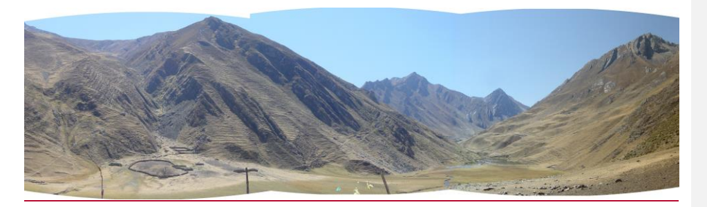
FIGURE 1.2 HERE On the puna. Corral and herders' house at Pampas, over Rapaz.

Like most mountain dwellers, Rapacinos (who numbered 711 in the 2007 census) move around the landscape. They live part of the time in their high-lying village, partly because that is where the government provides compulsory school for their children. The nuclear village remains the place for reunions and festivities. But apart from holidays, on any given day under half of the Rapacinos are in town. Many roam up on the high slopes ( puna ) with animals: llamas, alpacas, cows, sheep, and a few horses and donkeys. As one follows them to the highest pastures, grass gives way to cliff-growing lichens that look like gaudy petroglyphs, then to bare rock and snow. Puna life is life at the very end of the biosphere. At night, shivering under millions of stars, one feels the chill of interstellar space disturbingly close.