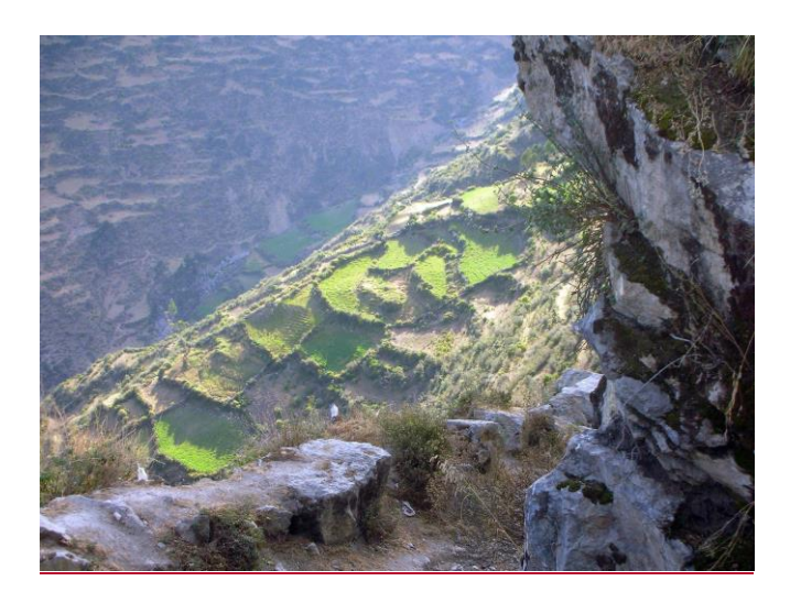
FIGURE 1.7 HERE Path from Rapaz village down to terraces presently used as comuneros' parcels in Sector Pueblo

of the three crop groups, and four (later five) resting zones ( moya ). When each comunero has his full complement of fields, about 300 plots are in use in each of the three active zones. Obviously this creates enough complexity to make constant patrolling for correct use a big task, and it is the officers of Kaha Wayi who perform it.